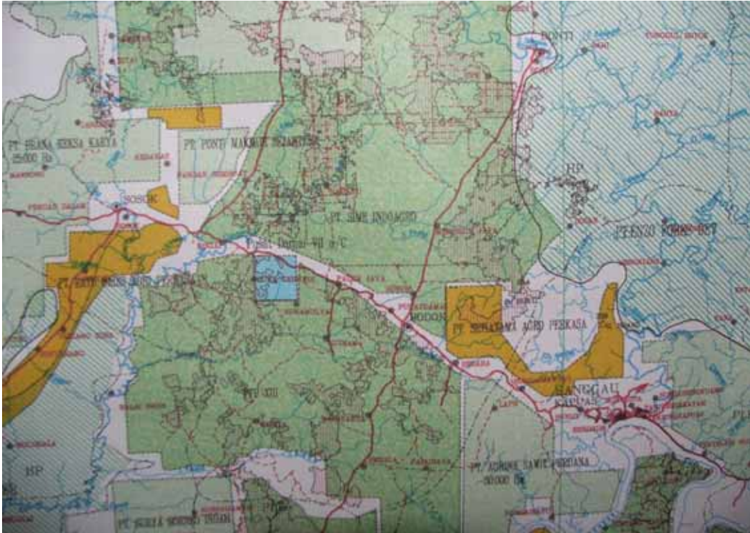
Almost all Dayak lands in Sanggau have now been allocated to oil palm plantations