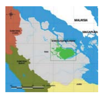
The lowlying Kampar Peninsula lies on the eastern seaboard of Riau, right on the Equator

Local NGO Scale Up estimates that 33,000 people depend on the Kampar Peninsula for their livelihoods