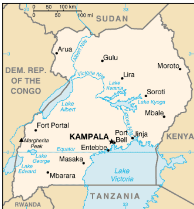
Present-day Uganda: The northern Nilotic groups occupy the areas around Gulu and Lira, Nilo-Hamites around Moroto and Soroti, Sudanic groups around Arua, and the Bantu around Masaka and Jinja. The Batwa areas are in the south west, to the south of Lake Edward, and only became part of Uganda in 1912.

Pre-colonial Uganda was inhabited by a number of tribes who mostly belonged to four main ethnic language groups. The different ethnic groups had their own traditions and cultural norms relating to land, but they had one feature in common: land was communally held under customary land tenure. Radical title to land was always vested in the community as a corporate entity rather than in the political organs through which control of the territory or the resources was exercised. 44