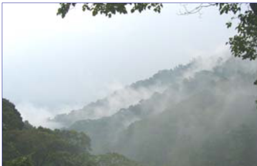
Mist rising from Bwindi Impenetrable National Park

Oral tradition and historians agree that the Batwa are the original inhabitants of the forest areas of the Great Lakes region of central Africa, where they lived as hunters and gatherers. In south-western Uganda, the Batwa have lived around the forests of Bwindi Impenetrable National Park (321 km 2 ), Mgahinga Gorilla National Park (33.7 km 2 ) and Echuya Forest Reserve (34 km 2 ). The Batwa's history can be traced in this area, present-day Bufumbira county in Kigezi district, on the northern frontier of what is now Rwanda, an area inhabited solely by the Batwa until the mid-sixteenth century. These high-altitude forests, known as the 'domain of the bell' after the bells on their dogs' collars, belonged to the Batwa. 18