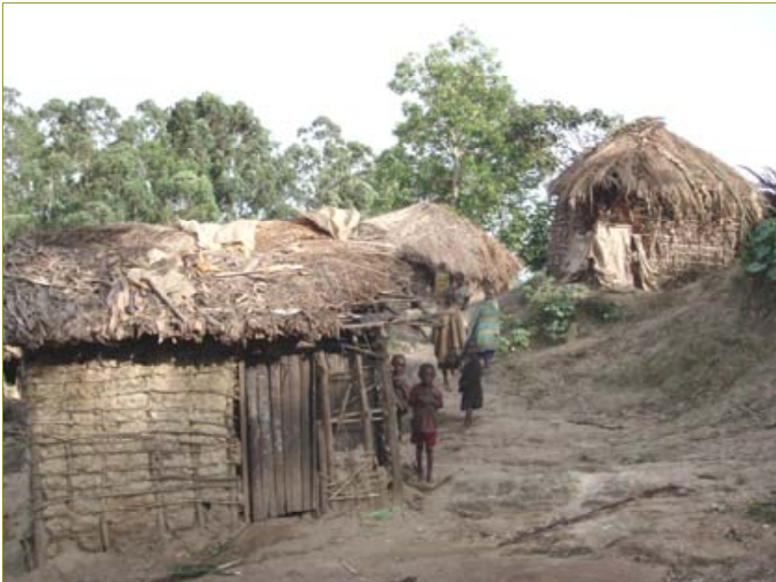
Typical Batwa village: Kamugemanyi community in Kisoro district Photo: T ea Braun

The volcanic soils of Mgahinga occupied by the Batwa are very fertile and thus ideal for farming. The Batwa have been the victims of fierce land grabbing by migrant farmers seeking such promising lands; in fact, this process began as far back as the 19 th century. 42 By taking advantage of the Batwa's hunger, and offering food in exchange for land, their unscrupulous neighbours have increased the Batwa's land loss. 43 Poverty has diminished the Batwa's ability to defend their rights.