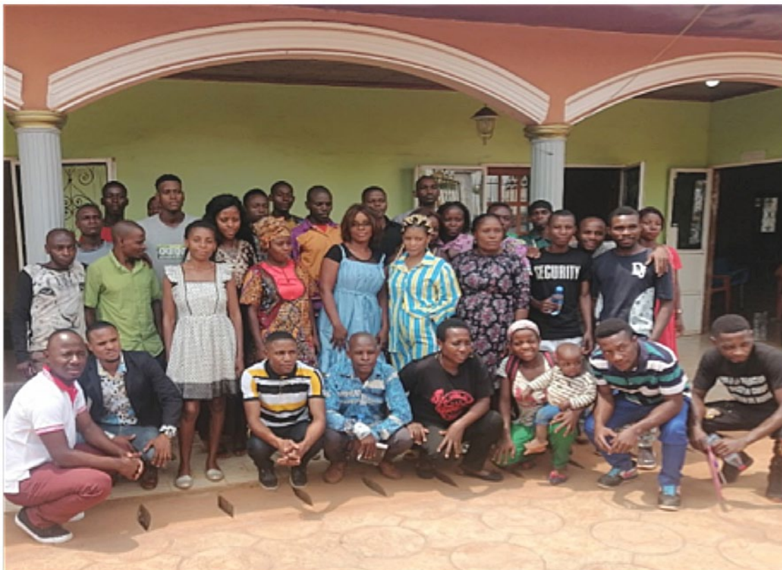
Participants at the Gbabandi youth general assembly, held in Abong Mbang in Feb-March 2022.

The Stichting’s work supports elements of all of the strategic approaches mentioned above, both directly and in collaboration with FPP UK. For further details on our joint work, see FPP UK’s annual report https://www.forestpeoples.org/en/annual-report-2022 .