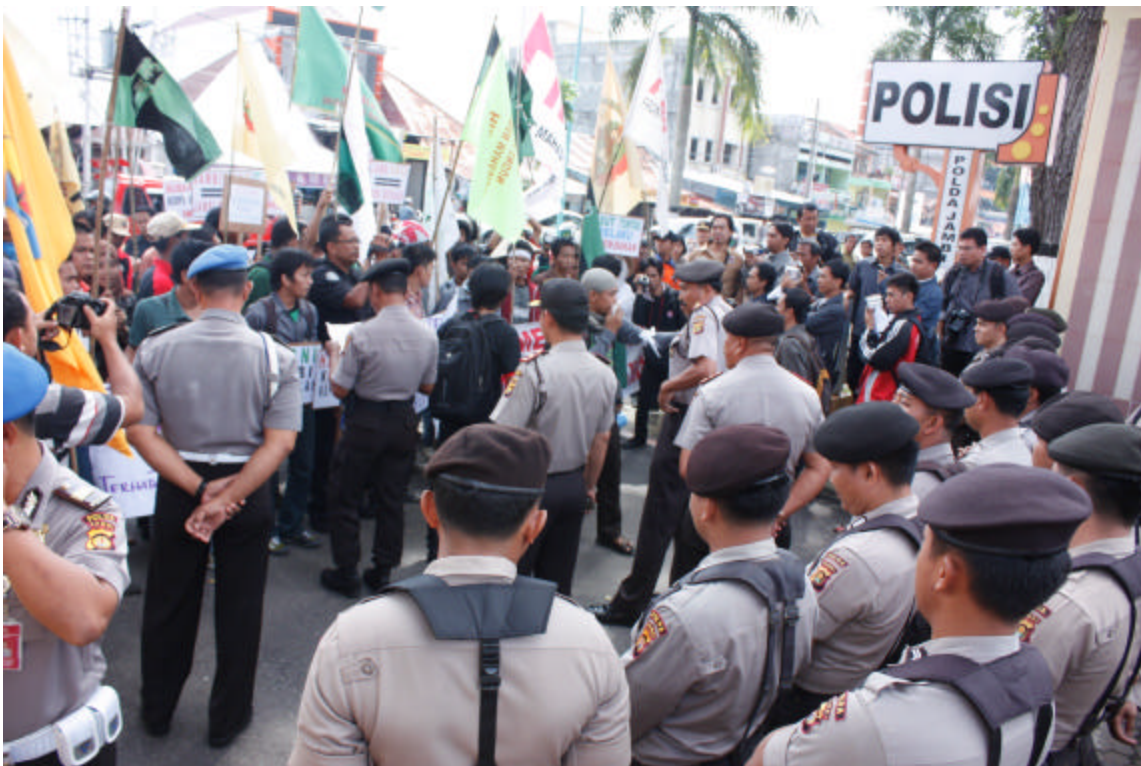
Jambi Students, NGO and farmer organization protest Police Office.