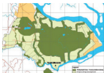
PT RAPP is acquiring plantation permits (HTI) in a ring around the Peninsula, while assisting Burung Indonesia (part of Birdlife International) to secure a conservation concession in the core zone

the canals opened up by loggers, thereby raising water-tables and securing the peat from drying out. The company would also plant some 150,000 hectares of A. crassicarpa , a species that can tolerate relatively high water tables, around the periphery of the Peninsula. This combination of activities would, the company argues, reduce net emissions from the Peninsula by about 10–12 million tonnes of CO 2 e/year. The project would however imply clearance of the degraded forests around the periphery of the Peninsula and, as presented, does not specify where local people would make their living or what rights they would have in the newly designated plantations, buffer zones and core conservation areas.