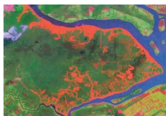
The forests of the Peninsula have already been heavily degraded by logging and conversion to plantations